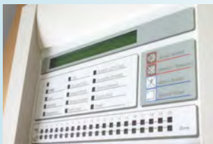
Fire / Security / Nursecall