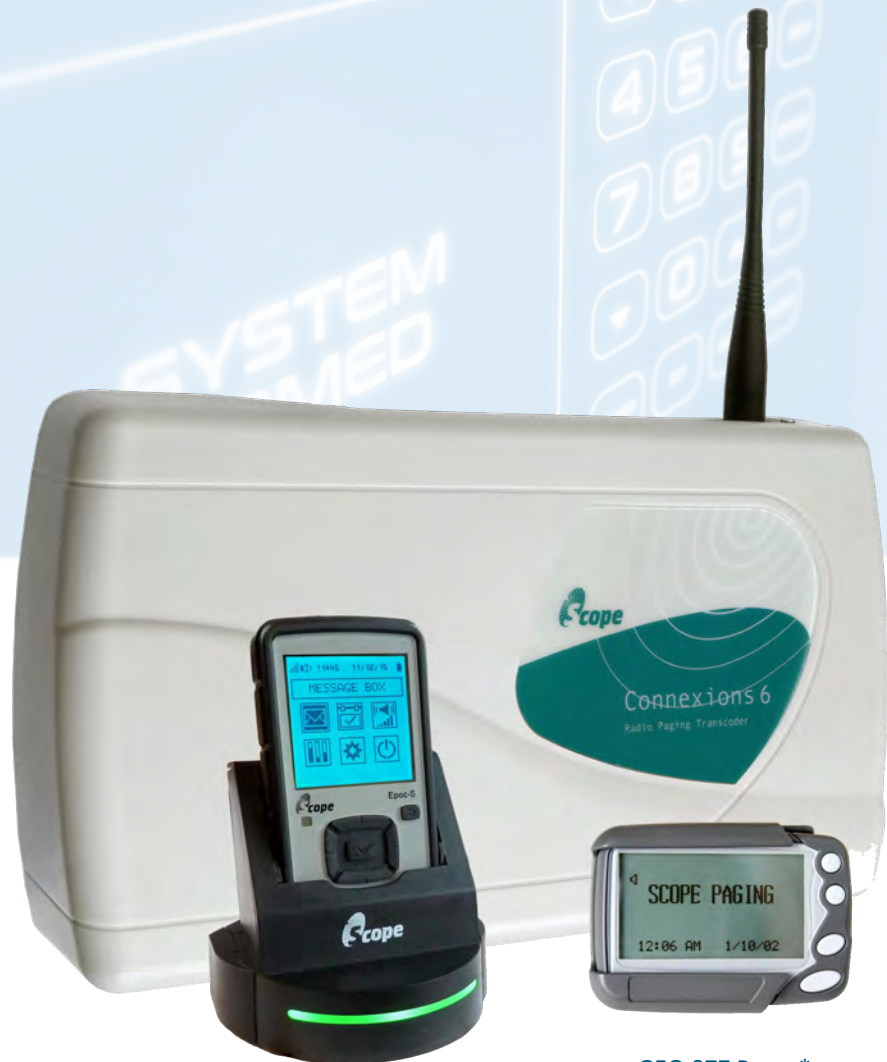
EPOC-S Responder in charger*