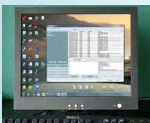
Connex Page / LAN